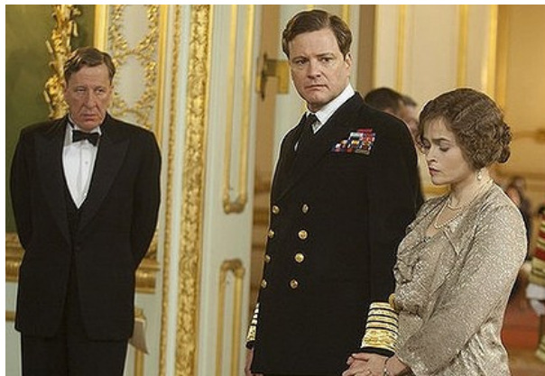
Colin Firth provides a true portrayal of the social and emotional implications of being a person who stutters in The King's Speech .